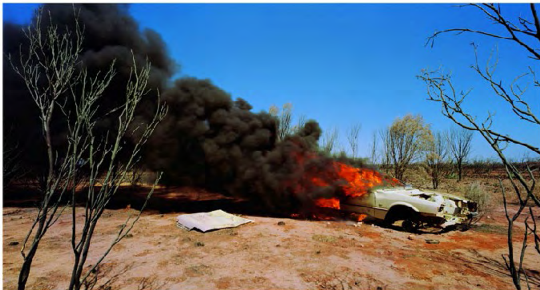
Rosemary Laing one dozen unnatural disasters in the Australian landscape #2 2003 type C photograph 110.0 x 206.0 cm

For an extended exhibition history please see the Museum of Contemporary Art exhibition catalogue the unquiet landscapes of Rosemary Laing .