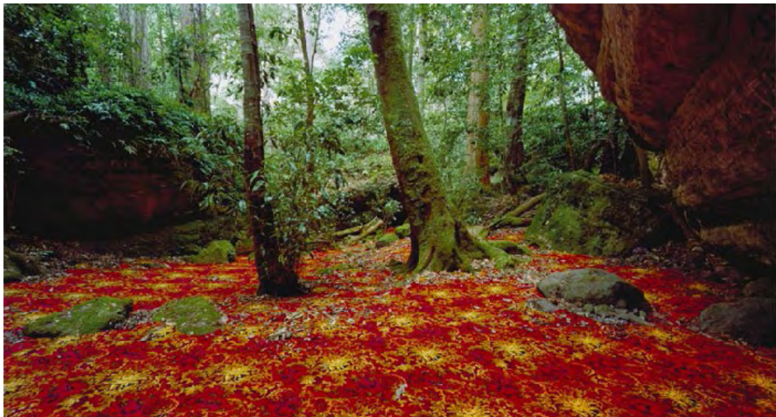
Rosemary Laing groundspeed (Red Piazza) #2 2001 type C photograph 110.0 x 205.0 cm © the artist

This image is part of the 2001 series groundspeed , shot by Laing at the Morton National Park on the New South Wales South Coast. 'Red Piazza' is the name of the carpet pattern and is reminiscent of carpet designs from Laing's childhood. Laing worked with a team to painstakingly place the carpet over the forest floor, even using carpet underlay.