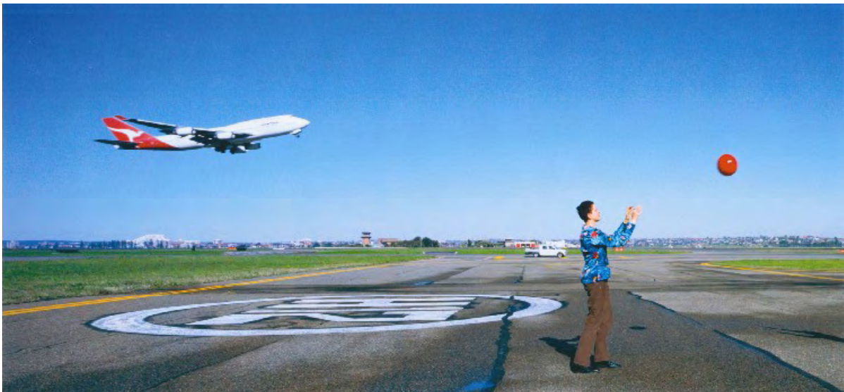
Rosemary Laing airport #2 1997 type C photograph 122 x 263 cm © the artist

This image is from the series brownwork , shot by Rosemary Laing in 1998 at Kingsford Smith Airport, Sydney. This series of work began not long after Laing moved into Petersham, a suburb under the flight path that crosses Sydney's inner-western suburbs. This work encapsulates Laing's concern with the relationship humans have to technology, how it mediates our movement both limiting and propelling us at the same time. The title refers to the more industrial, mechanical themes of the series in contrast to the lushness of the preceding series greenwork . Laing has said that the title alludes to the colour of the earth, and also to the process of labour.