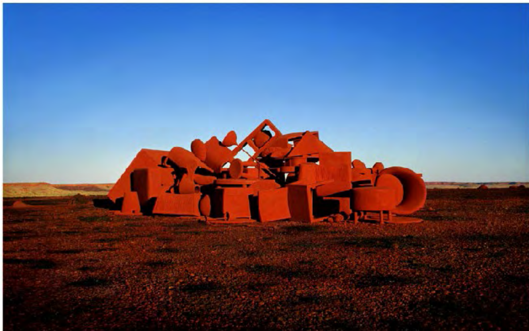
Rosemary Laing burning Ayer #1 2003 type C photograph 85.0 x 135.7 cm

Watch DVDs or videos of Australian movies which deal with our relationship to the landscape, such as Picnic at Hanging Rock (1975), The Well (1997), My Brilliant Career (1979), Priscilla, Queen of the Desert (1994) and Japanese Story (2003). What connections do these approaches to place have with the work of Rosemary Laing?